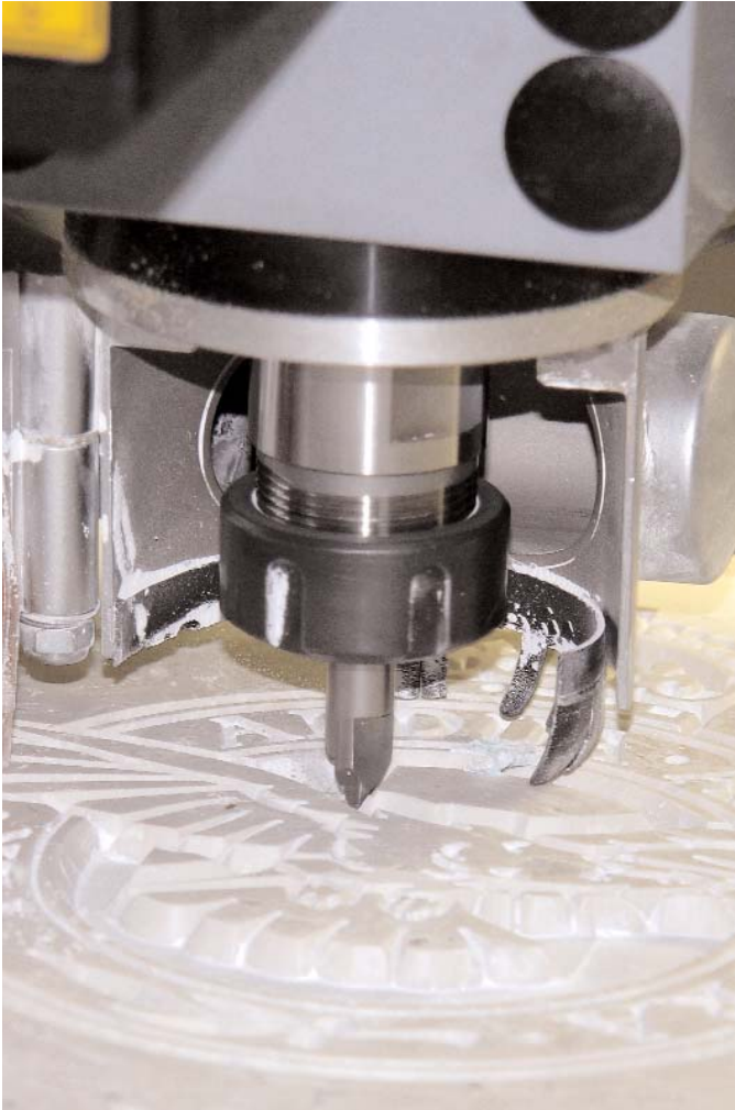
The Commission's latest Incisograph machine in action

Mechanisation over the years has increased the speed at which engraving could be done. The latest computerised system will allow a much faster rate of engraving and the finished product is expected to be of a higher standard.