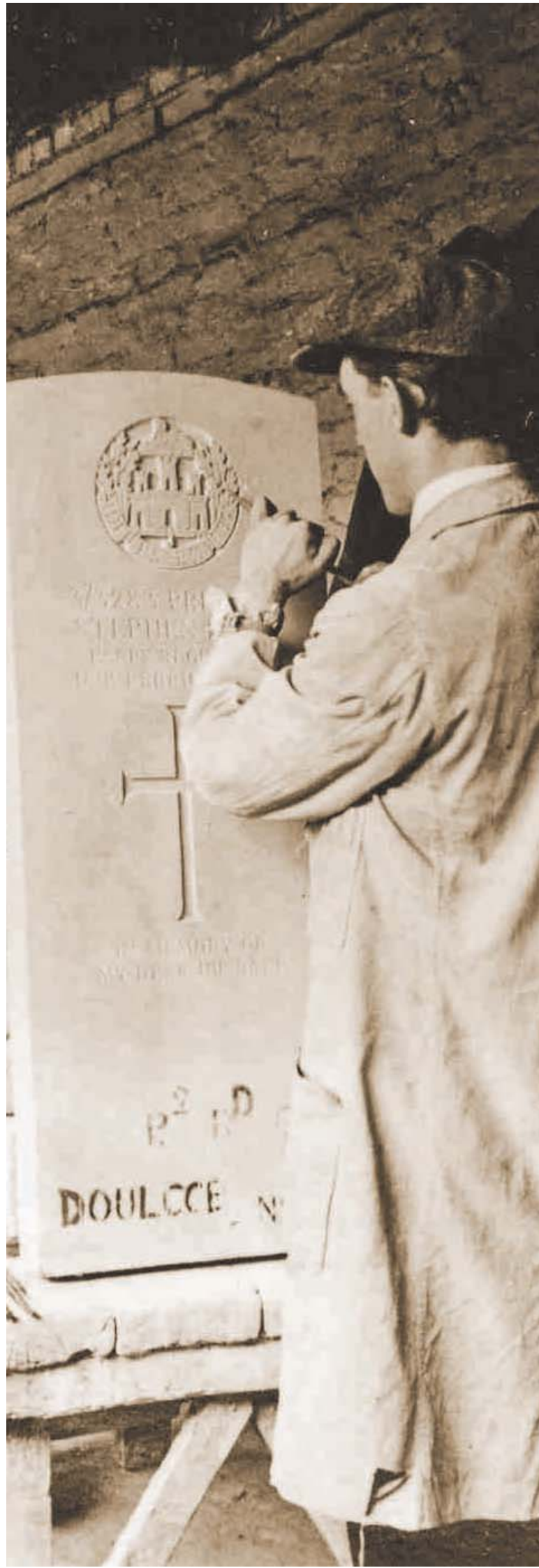
A contractor engraving by hand at a workshop in the United Kingdom

Millions of plants were grown to transform the cemeteries and soften the seemingly endless rows of headstones. For reasons of economy, the Commission established its own nurseries. Started in 1919, the building programme was not completed until 1938.