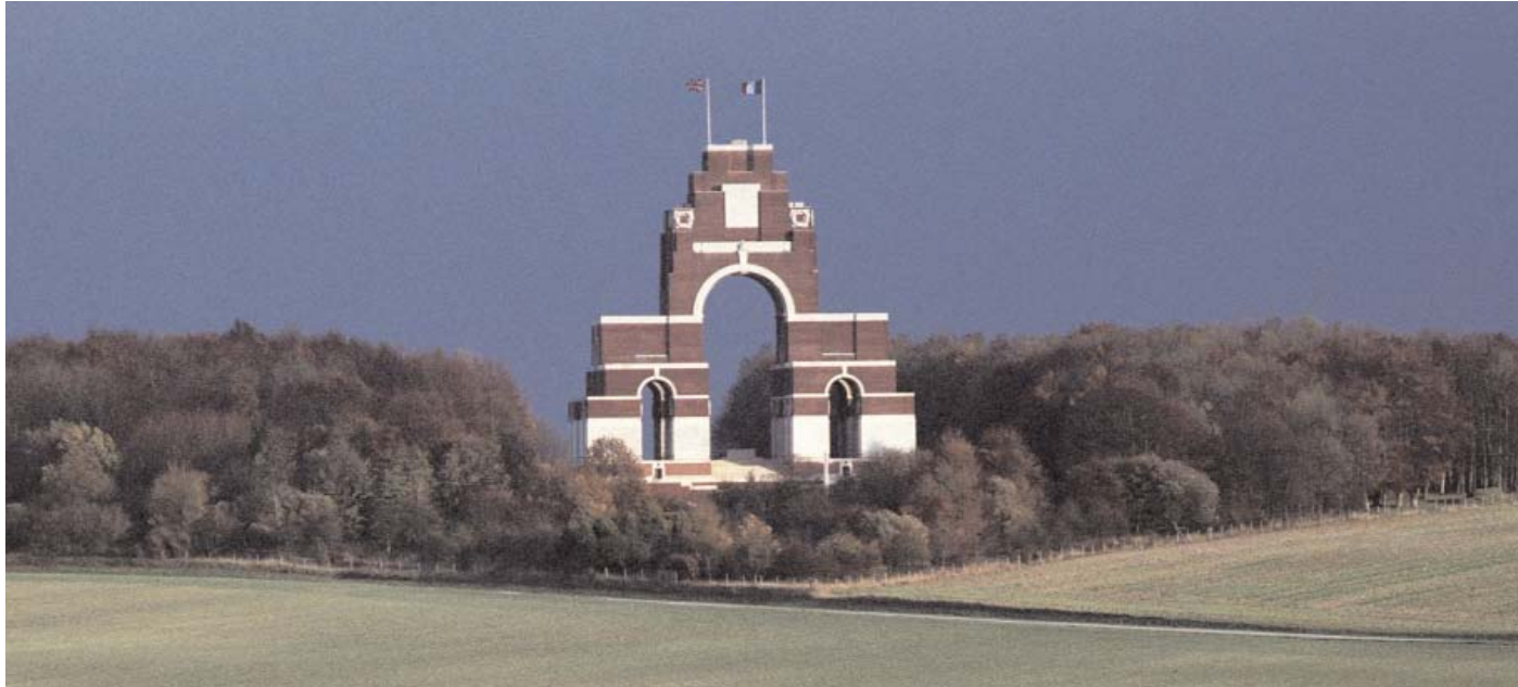
The memorial to the missing of the Somme at Thiepval, France