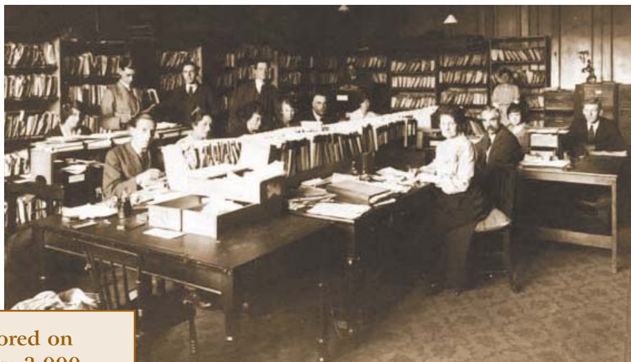
An office of the Directorate of Graves Registration and Enquiries in 1922

With another 600,000 names to be added to records already in excess of 1,100,000, the Commission kept pace with the task of recording the names and details of Second World War casualties. In 1947 over 60% were accounted for and by 1959 over 400,000 names were recorded and over 100,000 registers had been produced for the public.