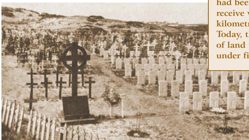
Construction underway at Coxyde Military Cemetery, Belgium

By the spring of 1921, 1,000 cemeteries had been established and deemed fit to receive visitors. By 1927, over 100 kilometres of hedges had been planted. Today, the Commission has 710 hectares of land under its control, of which 450 is under fine horticultural maintenance.