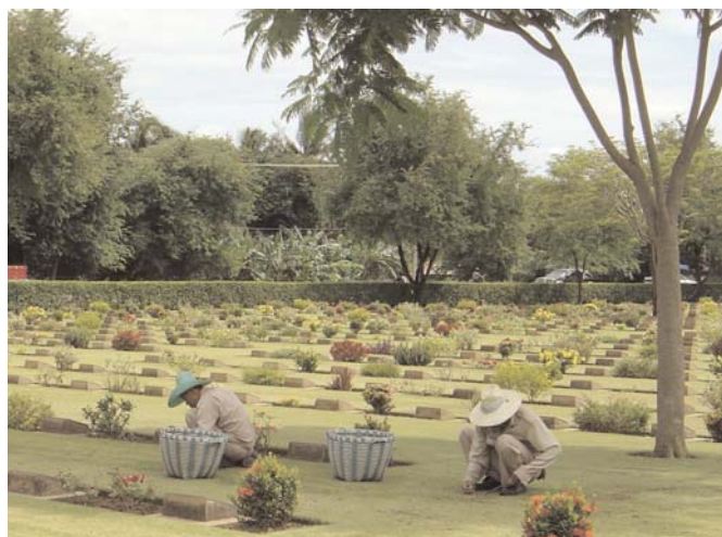
Chungkai War Cemetery, Thailand

Throughout the past ninety years, the Commission, in the interests of maintaining the highest standards appropriate to those commemorated, has met the challenges of construction, maintenance, conservation, development and innovation. In so doing it has recruited and supported a committed work force, used the most cost-effective methods associated with machinery, technology, staff organisation, contracting and materials. The challenge to continuously improve its operations and management remains and the Commission is dedicated to meeting that challenge with the same vigour it brings to the task of remembering the 1,700,000 Commonwealth men and women who died.